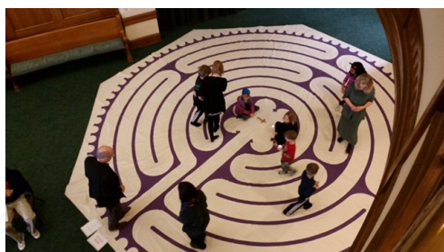
The labyrinth is open for walking meditation every Wednesday, 11:30 -1.