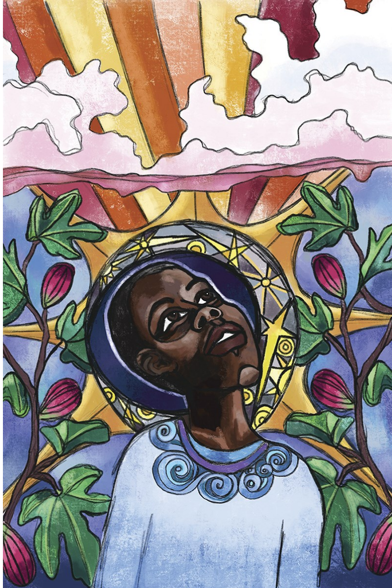
Raise Your Head, lewp studio