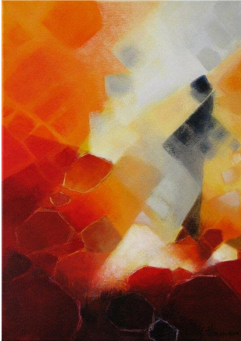
The Transfiguration from Church of the Savior, Wheaton, IL