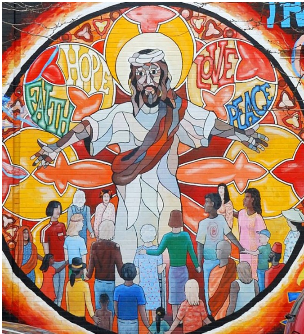
Jesus Mural of Faith, Hope, Love, and Peace, from Art in the Christian Tradition, Vanderbilt Divinity Library, Nashville, TN