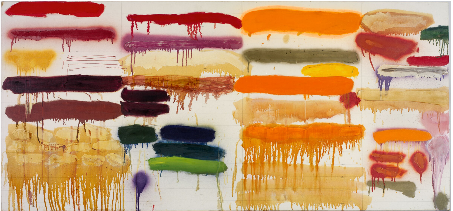
Summer Orange by Joan Snyder, courtesy of Harvard Art Museums